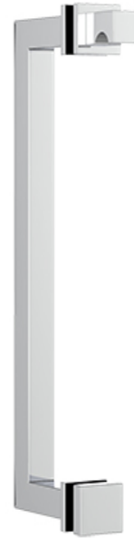
Single Door Handle with Knob shown with a medium Rosette